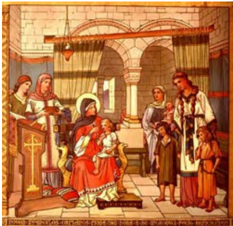
St. Margaret of Scotland, Nov. 16